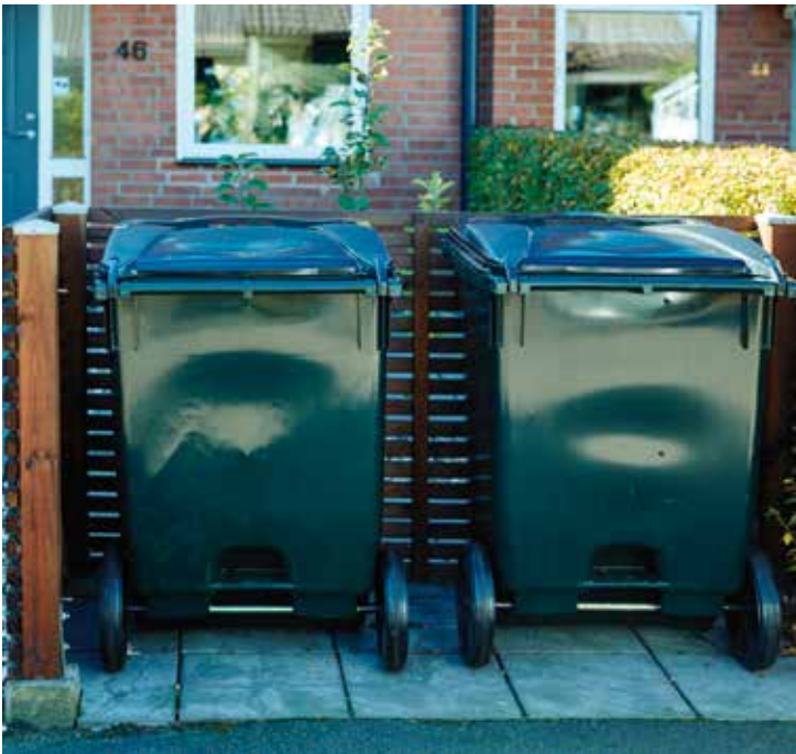
Example: a fence for the containers.

The one thing to remember is to make it easy for us to collect the containers. Make sure there is enough space between the containers and any enclosure. Place the handles facing the road.