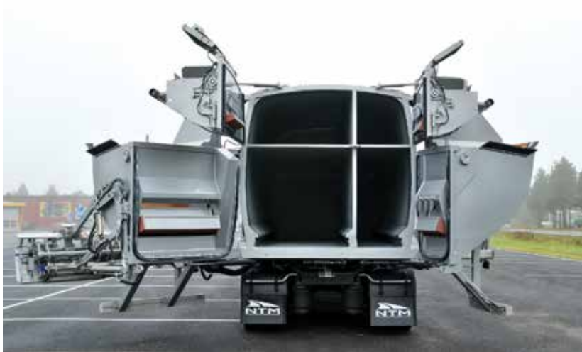
This is the new garbage truck. Walls divide the truck into four sections.